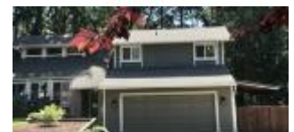
500 CASCADE DR Springfield, OR 97478