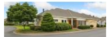
3316 Lake Wood Dr. Eugene, OR 97408