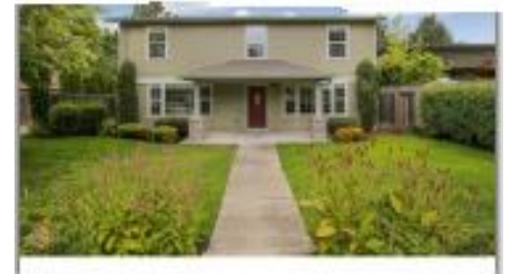
1263 CRENSHAW RD Eugene, OR 97401