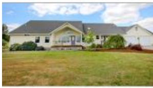
28810 ROYAL AVE Eugene, OR 97402