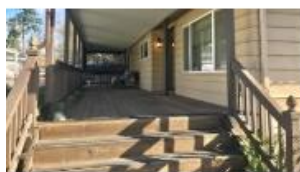
1475 GREEN ACRES RD SPACE #140 Eugene, OR 97408