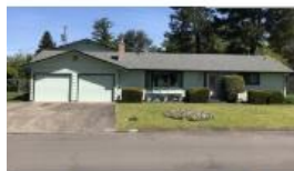
441 LANTANA AVE Eugene, OR 97404 RESIDENTIAL Detached Single Family