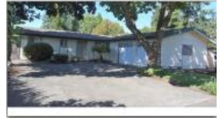
1565 HOLLY AVE Eugene, OR 97408