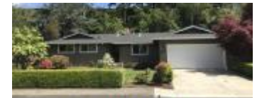
1881 HAPPY LN Eugene, OR 97401